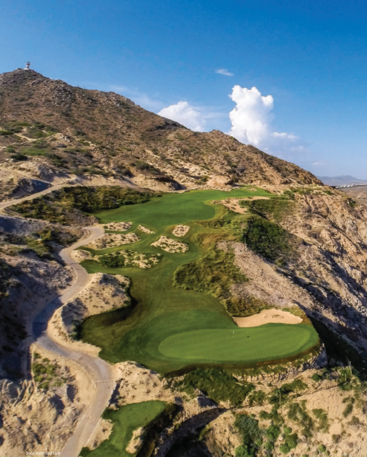
Troon North Golf Club