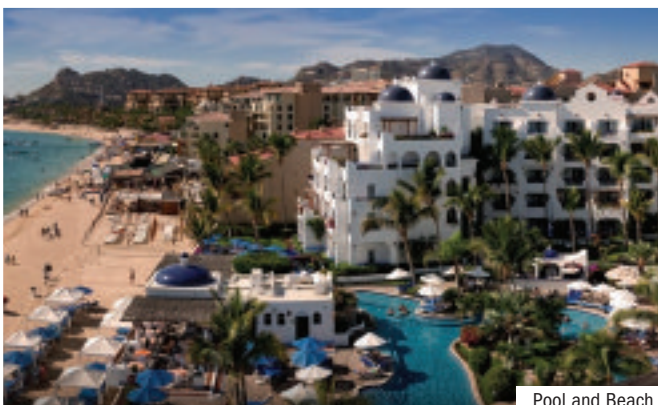
Pool and Beach