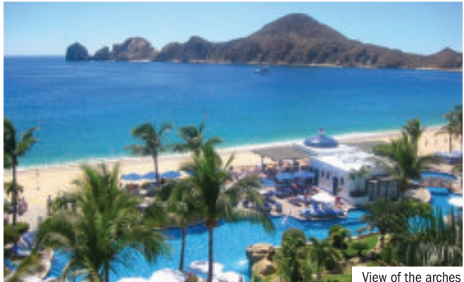
View of the arches