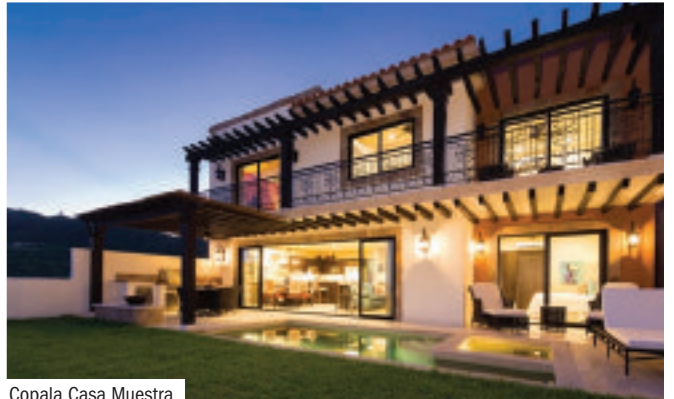
Copala Casa Muestra