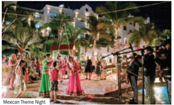
Mexican Theme Night