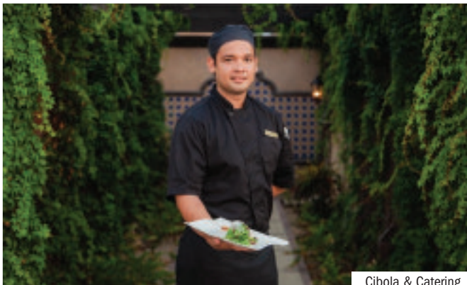
Cibola & Catering